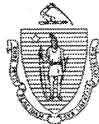
Deval Patrick Governor